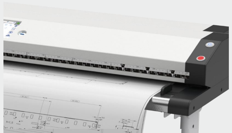
A USB 3.0 port let you take away your scanned images on a USB device.