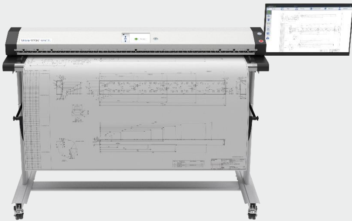
Large documents like maps rewind to the front or fall into the paper catch.

The WideTEK® 48CL produces extraordinarily sharp images, with color accuracy even superior to competing CCD scanners. Document rotation is done on the fly, a scan of an E-sized / A0 document in landscape at 300 dpi in 24bit color takes less than 7 seconds to scan and another 2 seconds to crop & deskew, preview and store.