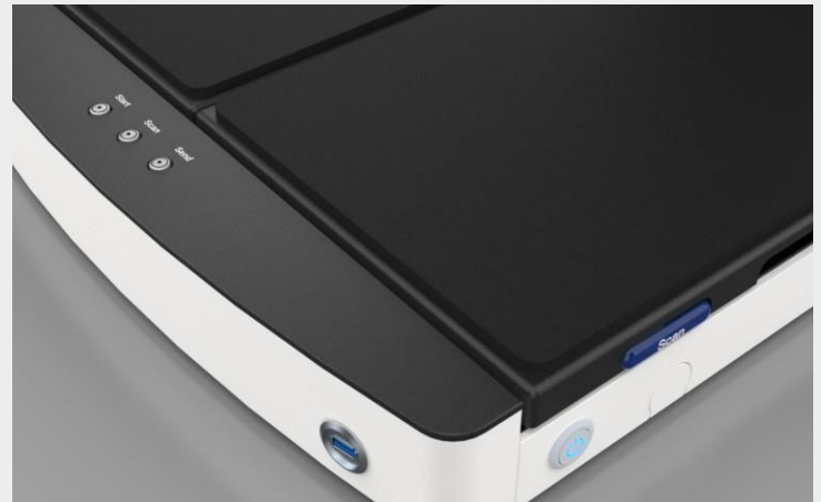
Store images directly to any USB devices via the USB 3.0 port