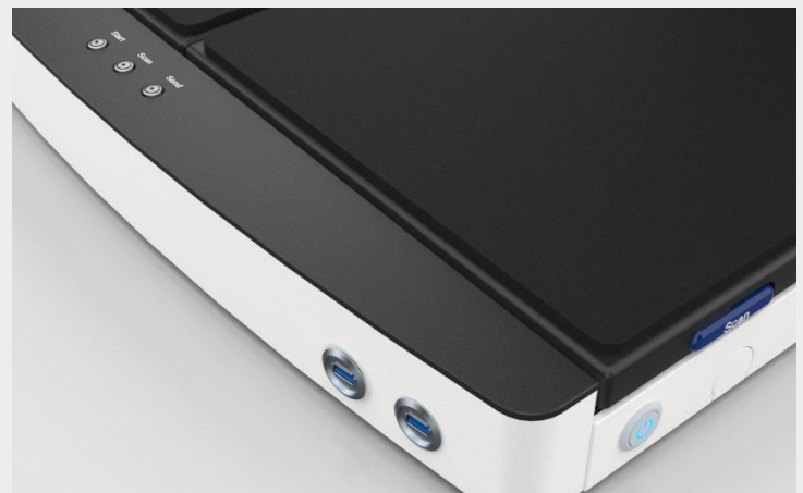
Store images directly to any USB devices via the USB 3.0 ports