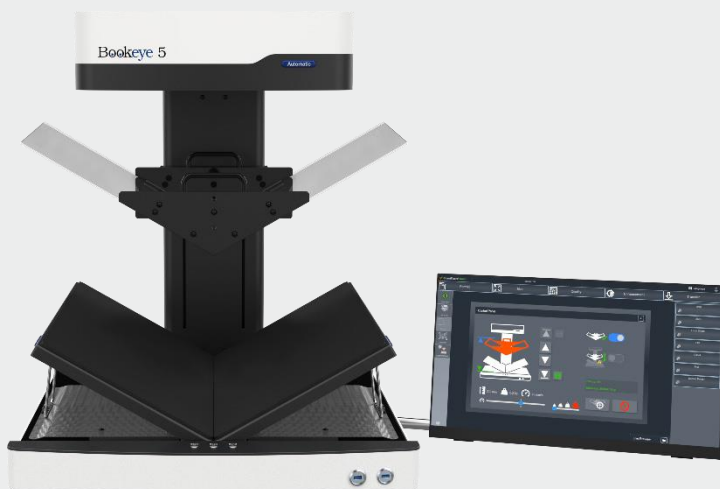
The Bookeye® 5 V2A Automatic with V-shaped book cradle and glass plate.

The V-shaped glass plate is controlled via the ScanWizard's extended user interface. The new control panel with animated function buttons allows, among other things, horizontal movement up and down, setting the speed or the position in which the glass plate remains after the finished scan job. It does not necessarily have to be at the top or bottom. Depending on requirements, the glass plate can be removed and refitted without tools and in two simple steps.